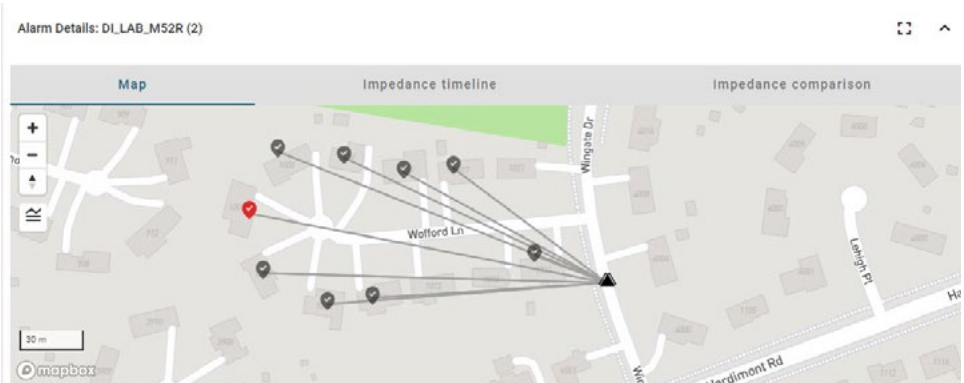
The map is a quick way to view where the impedance event is occurring, as well as where the connected transformer/meters are.